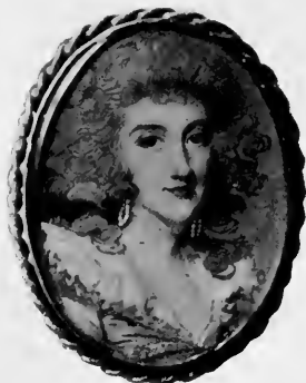
Niece of Admiral Coffin By Richard Cosway